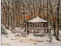
1 st Place Ira Silini