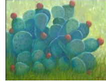
1 st Place Corky Copp