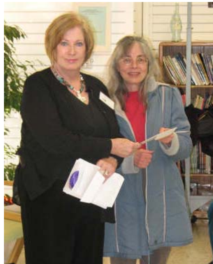
Below: Painting of the month 1 st place Linda Longshore